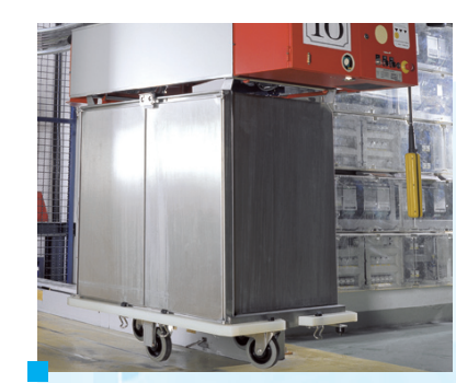
Automated trolley transport, suspended on the top-mounted electric conveyor

In-house or external transportation - a HUPFER® KÄNGURUH-SYSTEM® for all transport requirements.