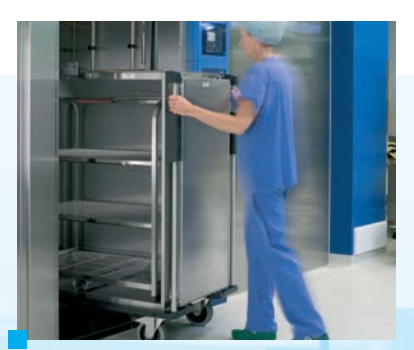
Pushing a transport trolley into a washing system