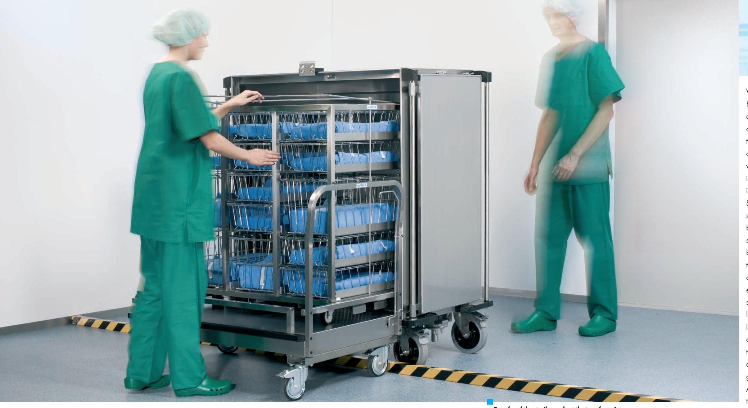
Transfer of the sterile goods at the transfer point

With its numerous advantages the HUPFER® KÄNGURUH-SYSTEM® provides the technical assistance necessary to make the sterile goods cycle run much more smoothly. When it is integrated into the process chain encompassing the whole area of sterile goods logistics, it clearly optimises the working process and therefore has a positive influence on efficiency and performance. The individual components of the HUPFER® KÄNGURUH-SYSTEM® are so tailored to each other that the strict separation of sterile and non-sterile areas cannot be breached. A transport trolley is used to move the sterile goods in containers or in soft packaging and baskets from the sterilisation area to the operating theatre transfer point. Depending on the transfer situation of a particular location, a transfer trolley is also employed. The real key feature is that the packaged sterile goods are located in a push-in rack which is locked inside the transport trolley. After docking, this locking arrangement is easily released using a handoperated lever, and the push-in rack is pushed onto the transfer trolley. Optimal separation of the sterile and non-sterile areas is guaranteed and the sterile goods do not need to be rearranged individually. After this transfer procedure, the sterile goods can then be transported further, put into intermediate storage or prepared for use.