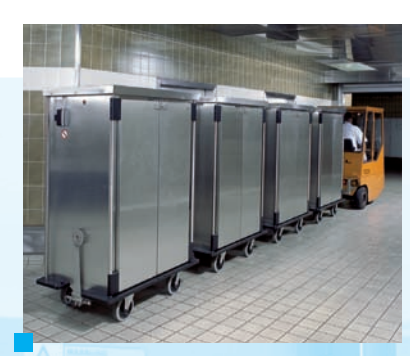
Transport trolleys in in-line operation