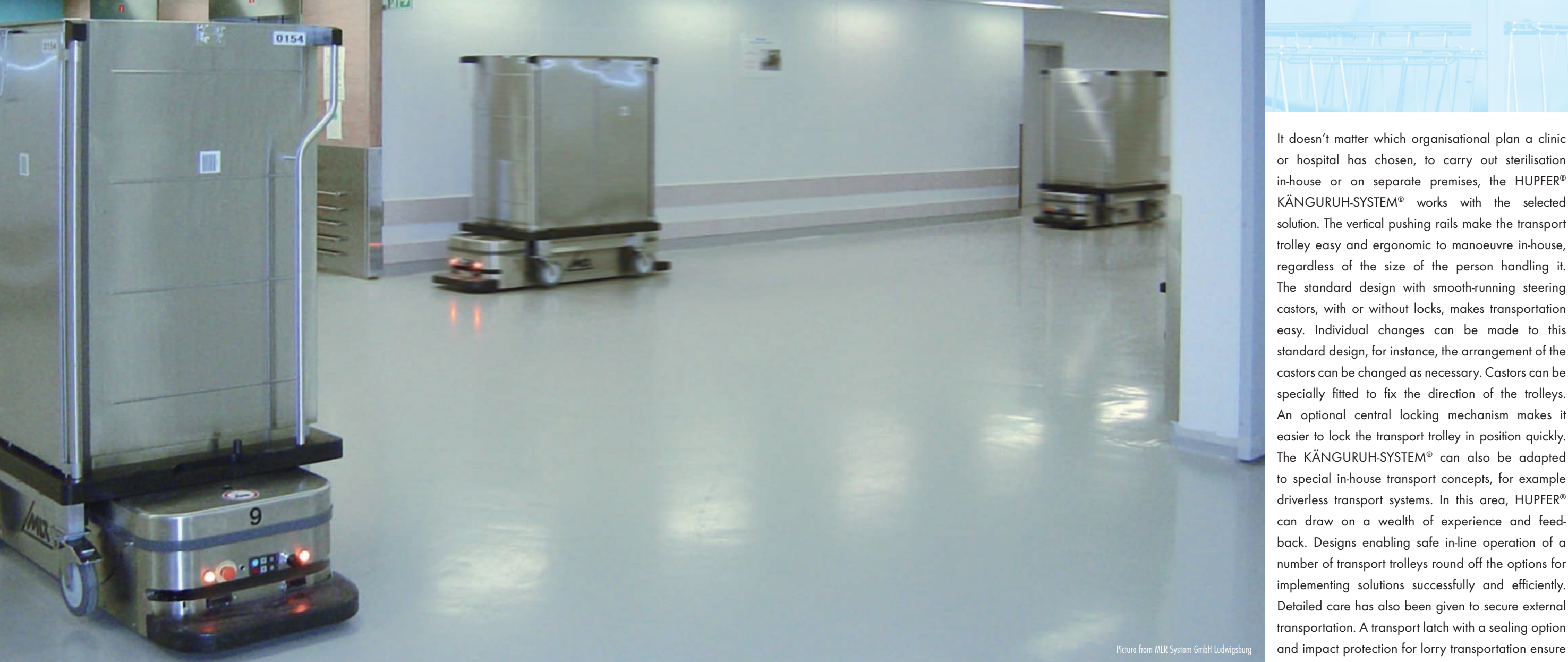
The KÄNGURUH-SYSTEM® can also be adapted to special in-house transport concepts, for example driverless transport systems. In this area, HUPFER® can draw on a wealth of experience and feedback. Designs enabling safe in-line operation of a number of transport trolleys round off the options for implementing solutions successfully and efficiently. Detailed care has also been given to secure external transportation. A transport latch with a sealing option and impact protection for lorry transportation ensure safety.