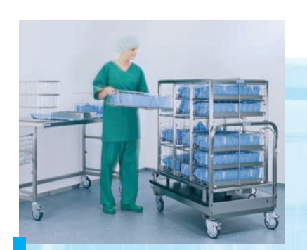
Loading the push-in rack with packaged sterile goods

A coordinated system to meet a complex challenge - the HUPFER® KÄNGURUH-SYSTEM®.