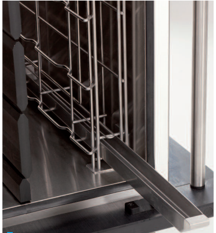
Integrated, removable drip tray below the eutectic plates.