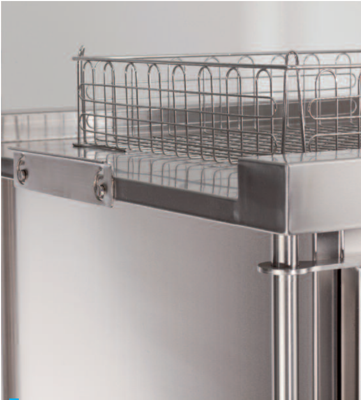
Optional transportation barrier rail on both ends, for carrying baskets on top of the trolley, for instance.