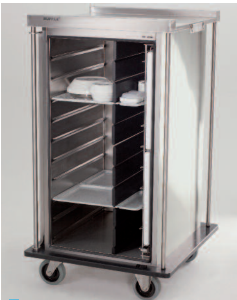
"Lunchtime" loading option with bases for keeping food warm (wax pellets) and standardised china items in the cold section.