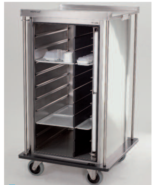
Loading option with standardised china items in the hot and cold sections.