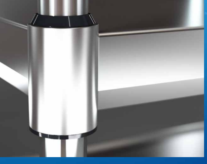
Durable shelf connection and strong welds for maximum load capacity