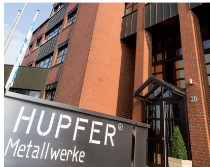
Our headquarters in Coesfeld, Westphalia