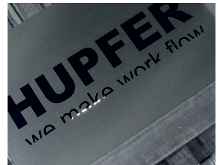
3-D, laser, robotics: in use here every day