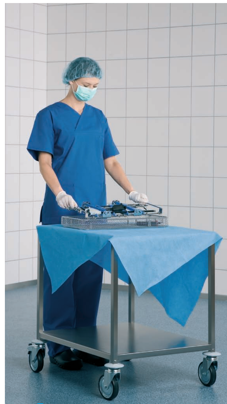
Laying out instruments easily and quickly using the 1-2-3-Rack®.