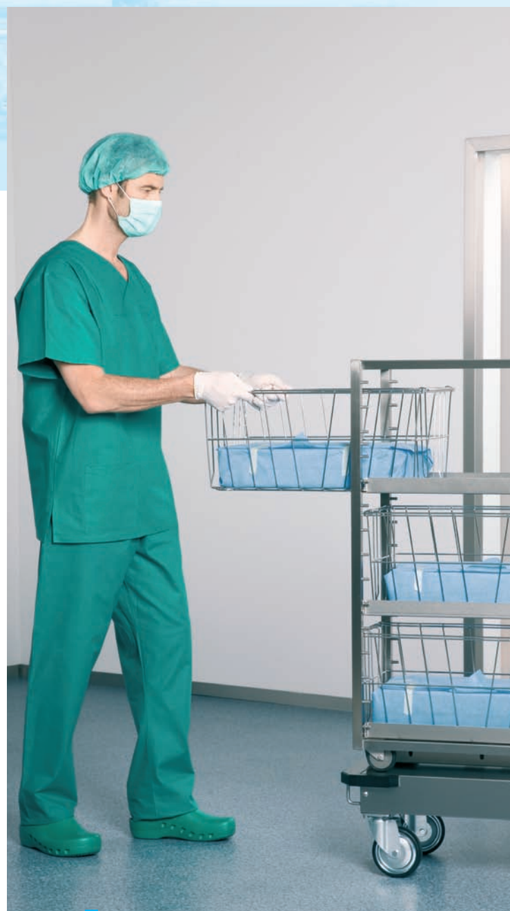
Preparation for instrument sterilisation in the 1-2-3-Rack®.