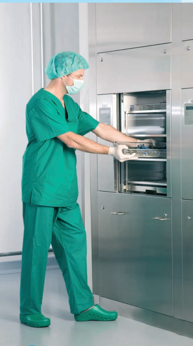
Cleaning the fixed instruments in the 1-2-3-Rack®.